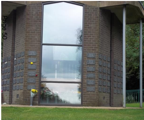
Chapel of remembrance