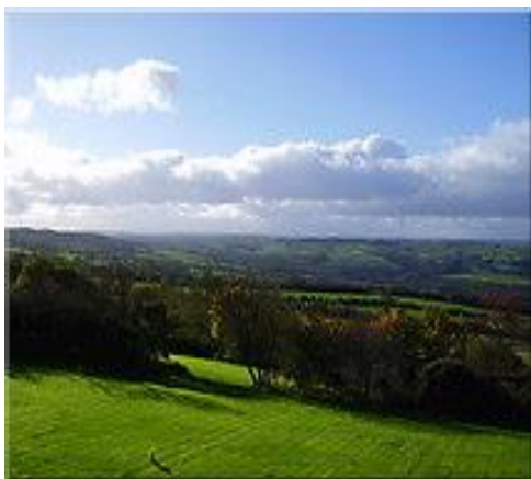
View from Mountsett Crematorium

us to view the performance of Mountsett Crematorium and provides a high-level overview of investment need.