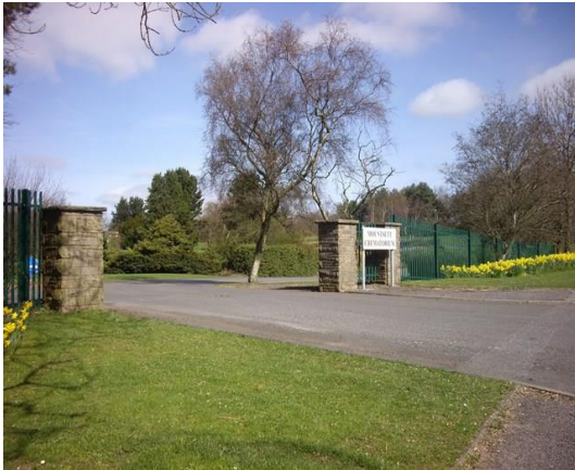
Crematorium front entrance

Suitability is about whether the property users/customers consider that the premises meet requirements in terms of use. A series of questions are asked around whether staff/customers find the heating/lighting/ventilation/decoration/staff facilities and general aesthetics etc in their opinion as good/fair/poor. This detail helps to inform future investment requirements. In this instance, the premises manager advised in his opinion what the issues were in terms of suitability, and this enabled the gaps to be drawn out. Although we usually find that the premises manager is the best source of knowledge, there may be other suitability issues that staff/customers may be able to highlight which could, subject to service approval and of course resources are included in the premises Investment Plan.