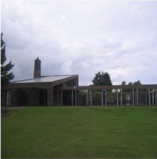
Crematorium general view