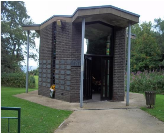
Chapel of Remembrance

The Chapel of Remembrance is situated to the right-hand side of the crematorium in an area designed for floral tribute.