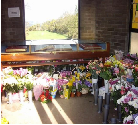
Bookcase within Chapel